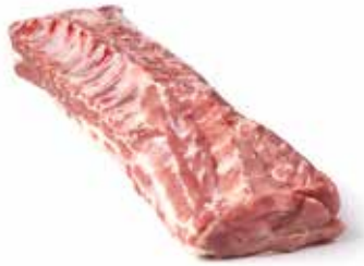
Lombo com osso